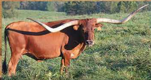
Wiregrass Magnolia - 92.5" ttt

COWBOY CATCHIT CHEX X 85"TTT KCCI RIO FANCY (OUT OF 90"TTT KCCI OUTBACK FANCY) OWNED WITH ELAH VALLEY AND KHAOS CATTLE CO.