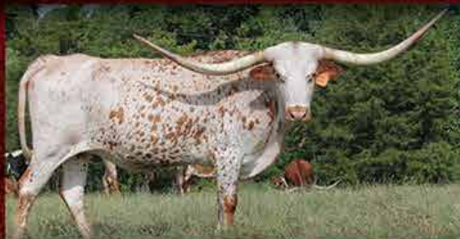
KC Rio Heidi - 80.5" ttt Owned with Craft Ranch