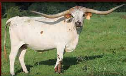
Hubble's Rio Tari - 80.5" ttt

ANN GRAVETT ROCHELLE, VA WWW.GANDGTEXASLONGHORNS.COM