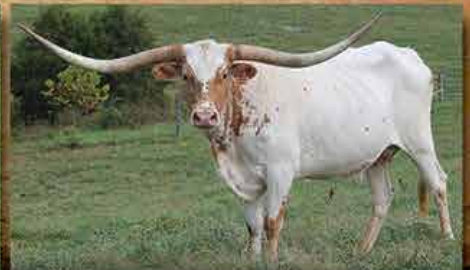
RRR Miss Super Gwen - 82" ttt Owned with Taryn Gravett