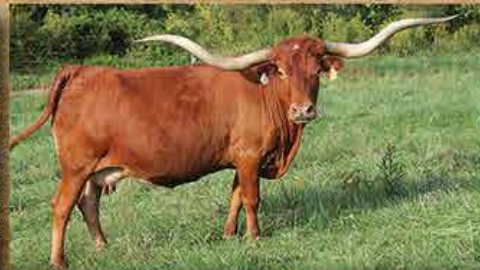
RT Diamond Ramblin Rose - 83.125" ttt